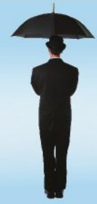
"PV" Hedge Price and Equivalent Weeks of Hedging